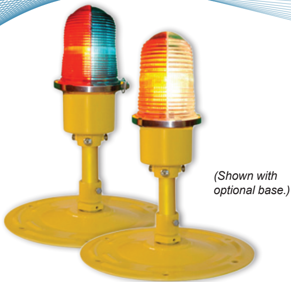
(Shown with optional base.)